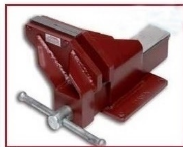
Offset left hand